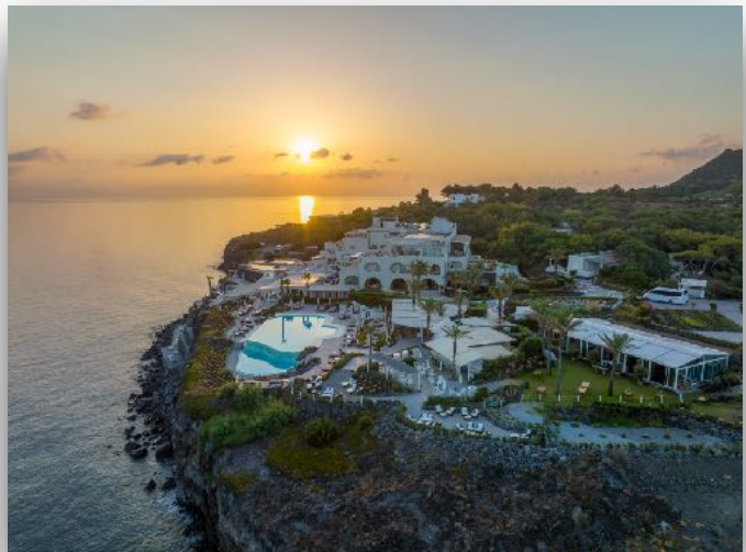
Therasia - present day