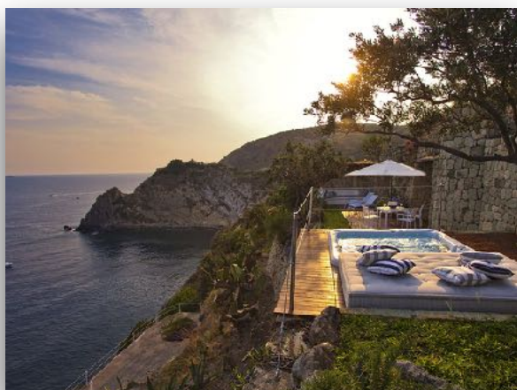
Costa del Capitano

The first acquisition is the Ville di Costa del Capitano on Ischia, a collection of magnificent villas overlooking the sea and surrounded by breathtaking natural scenery.