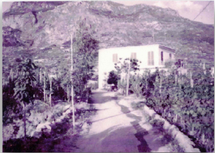
Early Days - Parco Maria