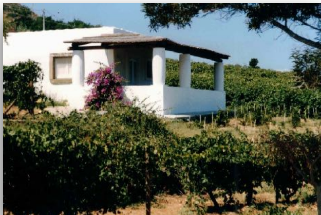
Therasia Property circa 2003