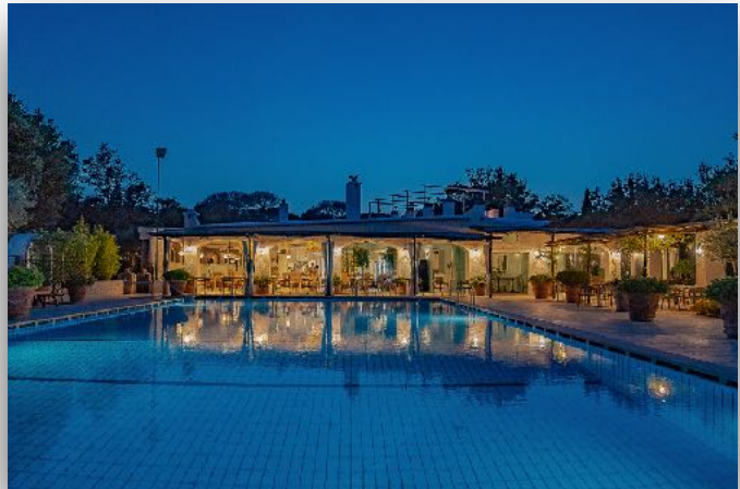
Botania Relais - present day

As we write, the Polito family is in a significant and deeply meaningful phase of expansion, with the acquisition of three new properties on the island of Ischia, each with its own distinct identity and extraordinary potential.