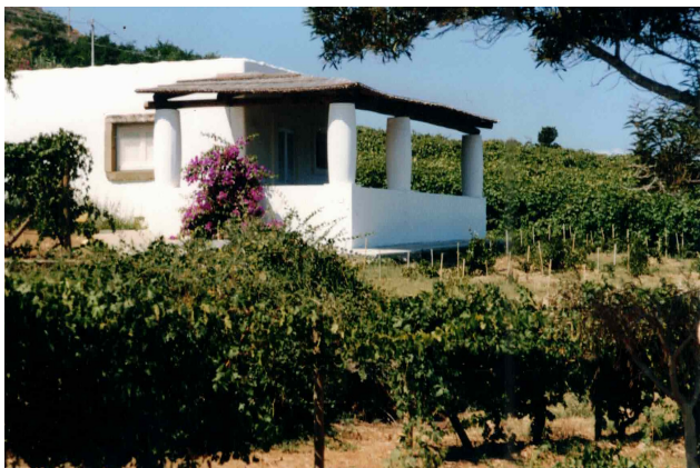
Therasia Property circa 2003