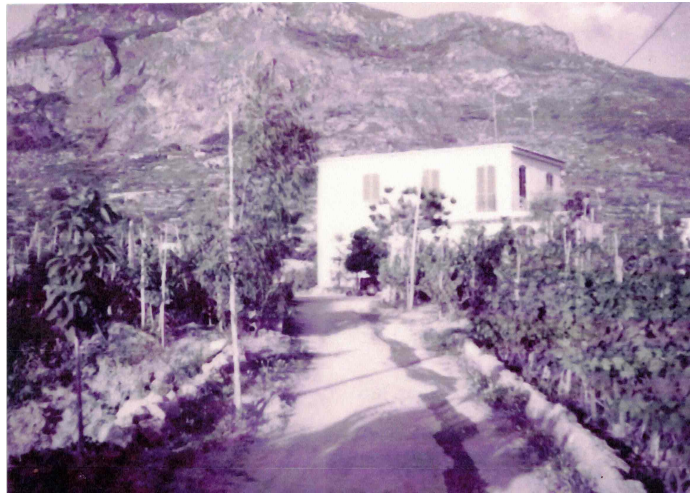
Early Days - Parco Maria